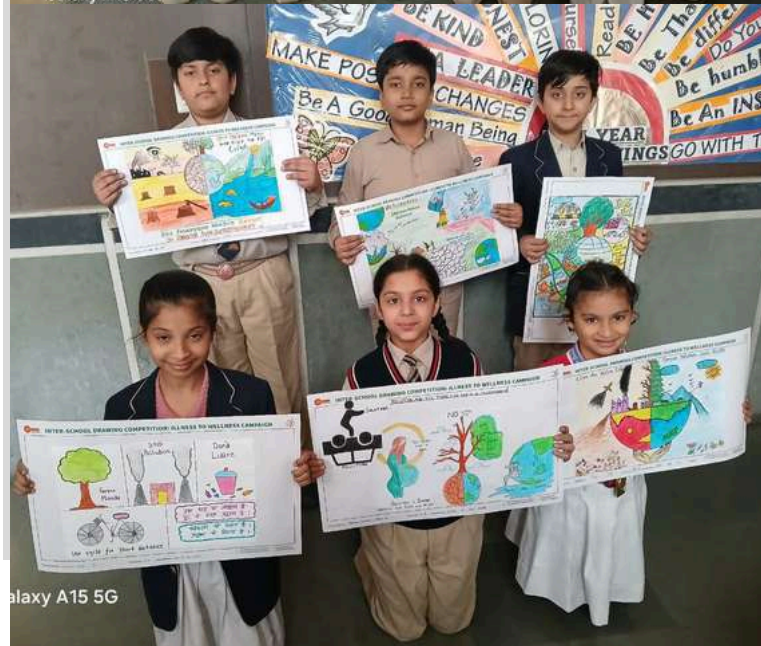
Galaxy A15 5G