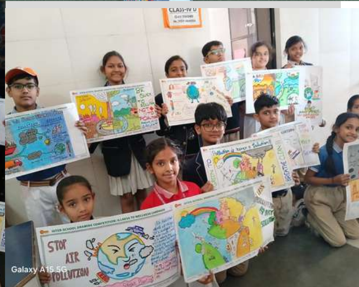
Galaxy A15 5G