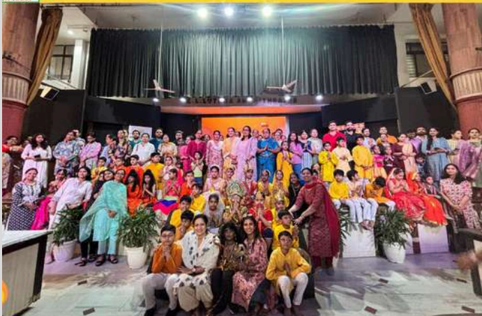
Milan Ka Tyohaar- Deepotsav