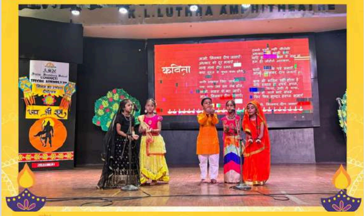
Milan Ka Tyohaar- Deepotsav