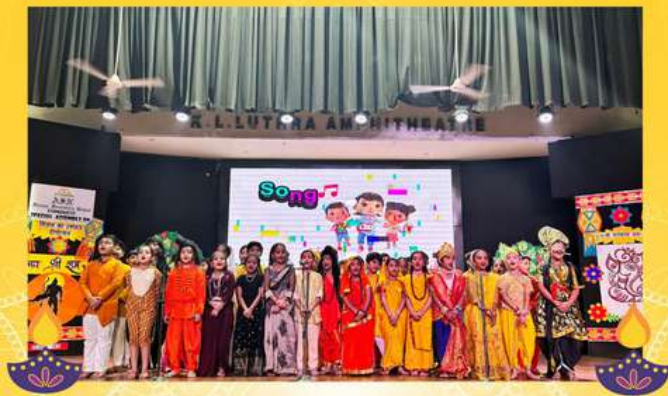
Milan Ka Tyohaar- Deepotsav