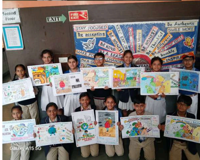
Galaxy A15 5G