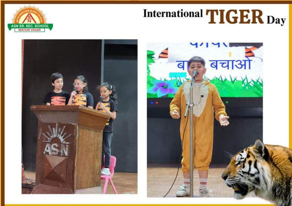
International TIGER Day

The peppy dance number related to the theme left the audience spell bound.