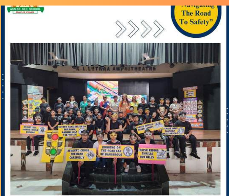
“Navigating The Road To Safety”