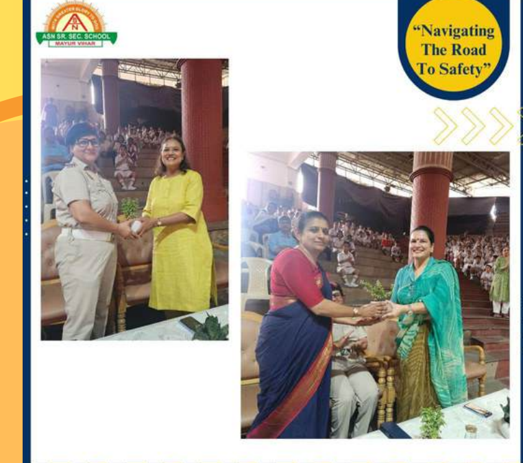
“Navigating The Road To Safety”