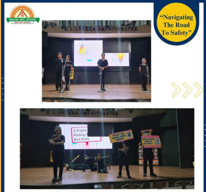
“Navigating The Road To Safety”

The assembly highlighted the importance of Road Safety through English and Hindi thought, Amazing facts ,a message giving poem, song and dance. The children also presented an intriguing mime act on road safety which was appreciated by one and all. The assembly provided an informative session on Road Safety.