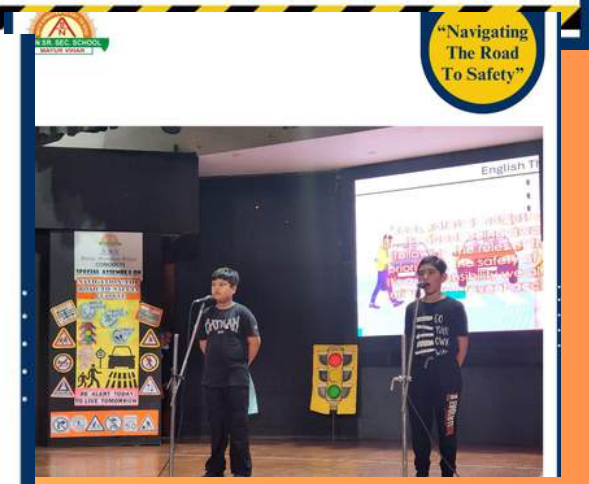
“Navigating The Road To Safety”